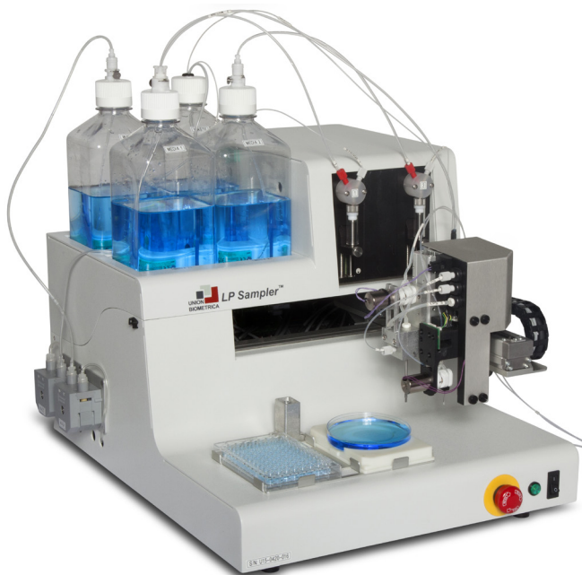
LP Sampler with Dispenser configured for VAST BioImager.

The Large Particle Sampler (LP Sampler™) module is the only automated sample introduction system designed specifically for gentle handling of large, fragile objects such as zebrafish larvae. The LP Sampler is capable of gently aspirating larvae from multiwell plates and delivering them intact to the VAST BioImager™ system for automated imaging. It has the flexibility to handle a variety of standard or deep well plates including 24, 48 and 96-well configurations.