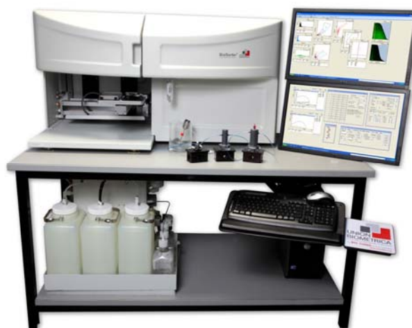
BioSorter with optional 2nd display