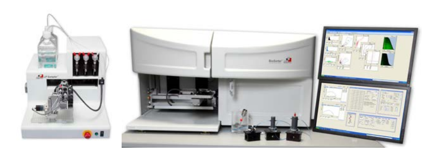
The LP Sampler module can be used with VAST BioImager as well as COPAS FP and BioSorter Large Particle Flow Cytometer systems.