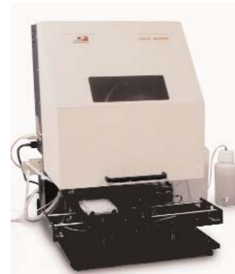
Figure 1. Picture of the COPAS XL System

Pomeroy, M., Memmott, J. Union Biometrica, Somerville, MA, USA